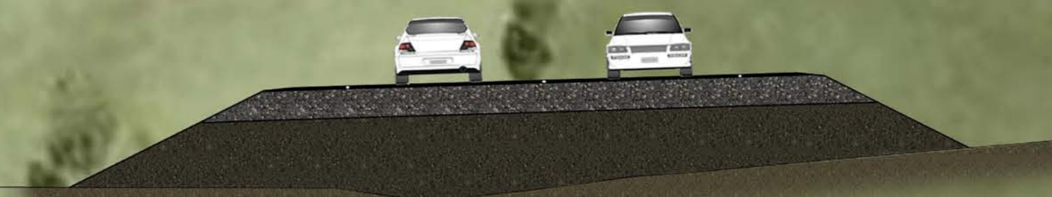
SECTION B-B - REALIGNMENT AND REGRADE OF ROAD (NOT TO SCALE)