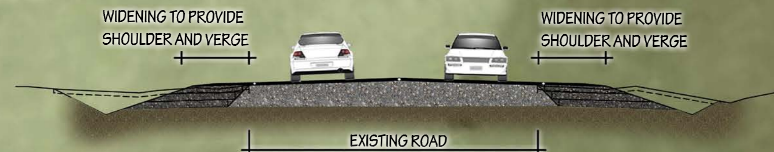
SECTION A-A - PROVISION OF SEALED SHOULDER AND OVERLAY (NOT TO SCALE)